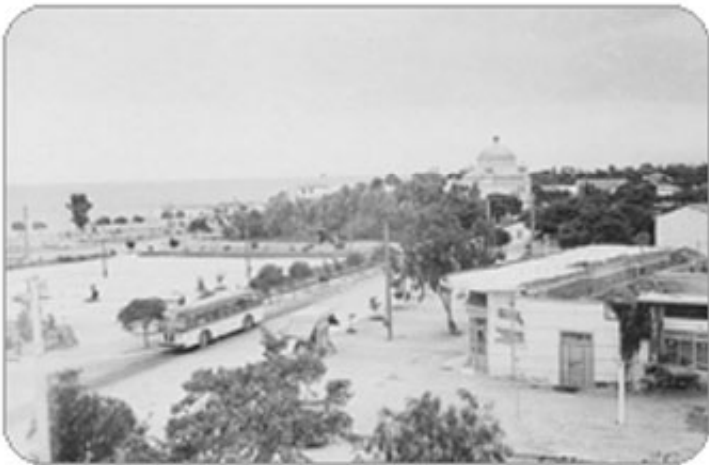
Δεκαετία του 1950. Αφετηρία Λεωφορείων